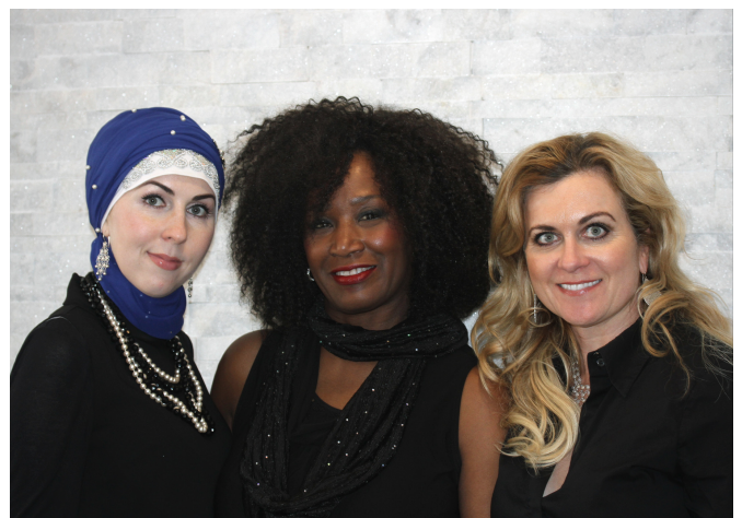
ReDerm MD Medical Spa's aestheticians

Our close association with Fante Eye & Face Centre enables patients to obtain immediate help with consultations and pre and post care for surgeries.